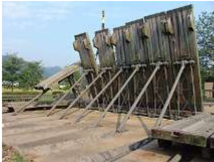
Wicket Dam or Tainter Dam