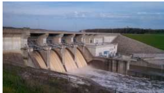
Wicket Dam or Tainter Dam