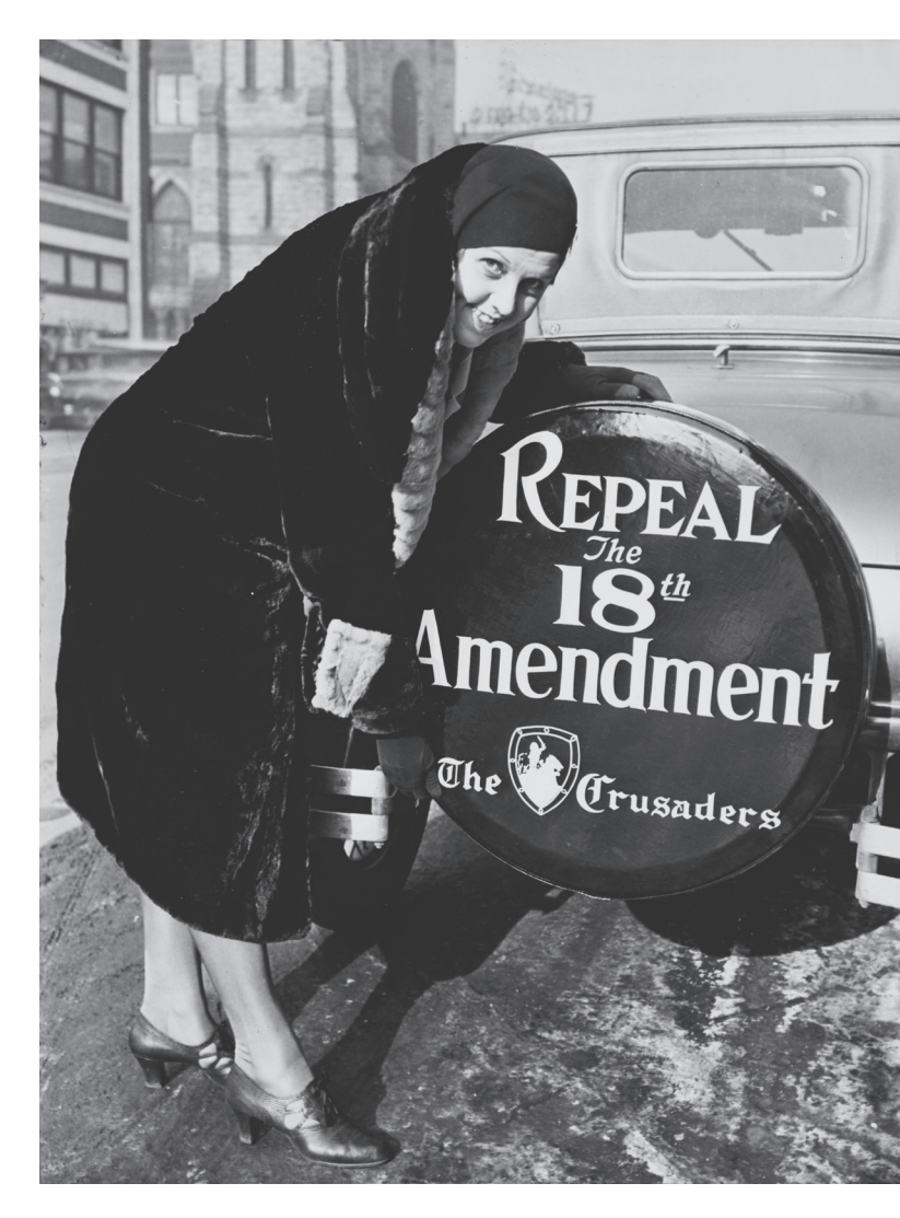
After 13 years, the 21st Amendment repealed Prohibition.

On December 5, 1933, the United States ratified the 21st Amendment, repealing the 18th Amendment. This was the first time in American history a constitutional amendment had been repealed. The 21st Amendment affirmed the power of states to make laws concerning the sale and transport of alcohol. Many states began tightly controlling liquor usage through licensing requirements, drinking age limits, and specific hours of operation for liquor sellers. Many of these regulations are still in force today.